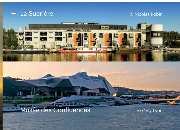
— La Sucrière